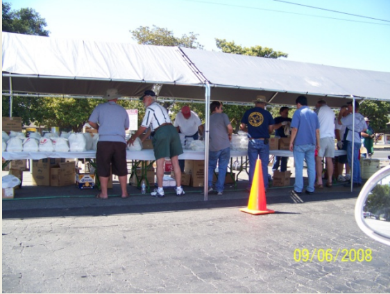
Voluntary sales and packaging Personnel